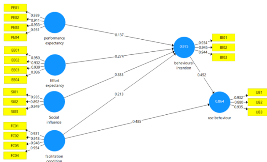
Figure 3. Loading Factor UTAUT Model

The validity test is carried out so that all research indicators that measure the research variables that have been distributed are valid or not. In PLS, convergent validity is seen through the results of factor loading of all indicators in the construct concerned. If the standard correlation coefficient value is 0.5 or more, then the data is declared valid [19].