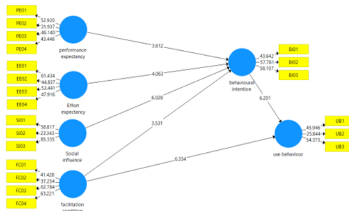
Figure 4. T-Statistic value of the UTAUT Model

After knowing the impact of each construct, the next step is to test the hypothesis and draw conclusions. Testing the hypothesis in this study uses a significance value of 95%. The T-statistic result with that level is 1.96. If the results of the T-statistic are outside the value range of -1.96 to 1.96, then the hypothesis is accepted or said to be valid [23]. Conversely, if the results of the T-statistic are in the range of -1.96 to 1.96, then the hypothesis is rejected or said to be invalid. The results of the UTAUT model test analysis are shown in Figure 4 and Table 8.