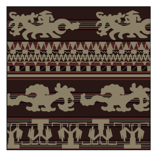
Figure 2. Tapis Tuho Cloth Motif

Tapis cloth is a woven cloth from Lampung that has a symbolic meaning. It is a symbol of purity that can protect oneself from external dirt, such as dust, and extreme weather, such as rain or the hot sun during the day. Tapis cloth also has a symbol of the social status of the wearer, where the form of the motif applied has the meaning of life, as well as the color of the basic cloth, which has a symbol of the greatness of the Creator (Isbandiyah & Supriyanto, 2019). The illustration of the Tapis Tuho's cloth motif is illustrated in Figure 2.