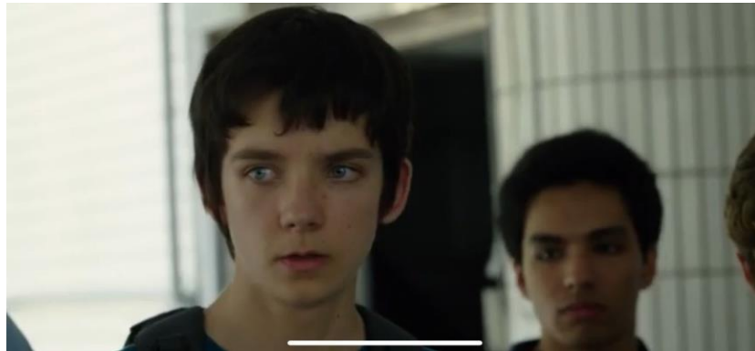
Figure 1, Nathan Successfully Earned Place In United Kingdom's Math Olympiad's Team

Richard : "Right! No point in dilly-dallying, I suppose. I'll pin your scores up on the board in a second. The five outstanding students guaranteed a place at the IMO in Cambridge this year is... Isaac. Lee Jing. Rebecca. Pav. And Ben. The last place was very tight between Nathan and Luke. Both scores are somewhat disappointing, but one of you will have to go to Cambridge. So, by the smallest fraction of a point, the last place on the team goes to Nathan. The six of you will be hosting the Chinese team at your own homes, and I'll see you all in Cambridge next week. Onward, Christian soldiers."