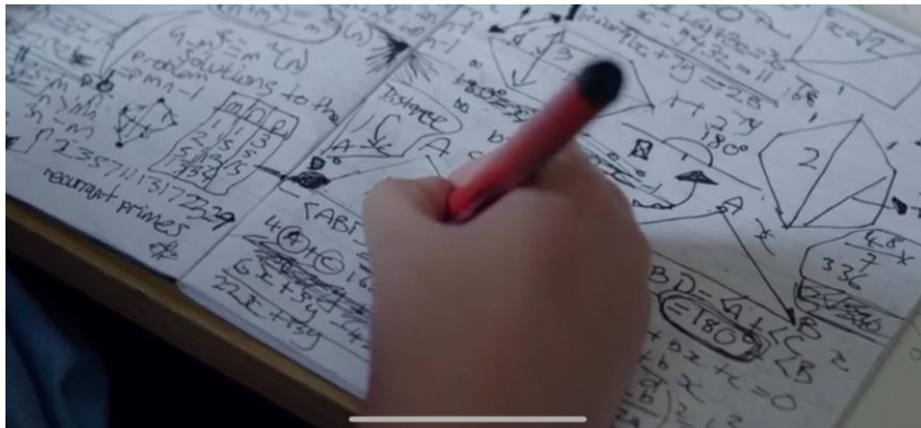
Figure 3, Nathan type about mathematic formulation in his book