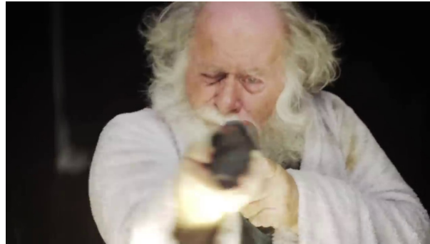
Figure 4. Scientists who aim at band members with guns