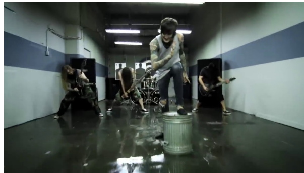
Figure 1. Suicide Silence members start performing a song at the indoor shooting range