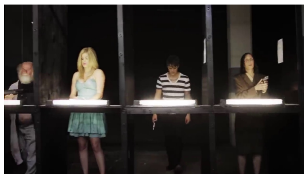
Figure 2. Shooters who are ready to fire at the indoor shooting range