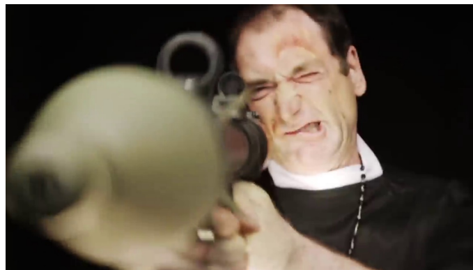
Figure 10. A priest aims a rocket launcher at all band members