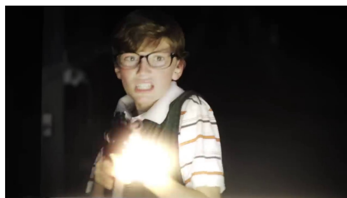
Figure 5. A child is furiously shooting at the band members