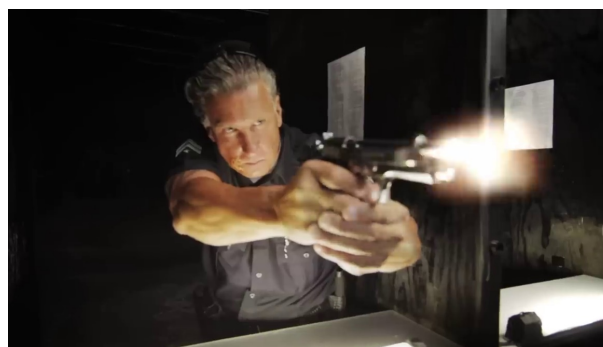
Figure 3. A policeman shoots his gun at one of the band members

The second sign states that the "You Only Live Once" music video has meaning since they are an interpretation of the intended message. In the second scene, these signs indicate people with diverse backgrounds, personalities, and points of view (see Figure 2 and Table 2). Of course, this will provide a barrier for people in social situations. These issues include: (a) how individuals view societal diversity; (b) the rejection of anti-discrimination regulations; and (c). Balancing and equating certain groups, and (d). The impact of individual differences (Ramos et al., 2016).